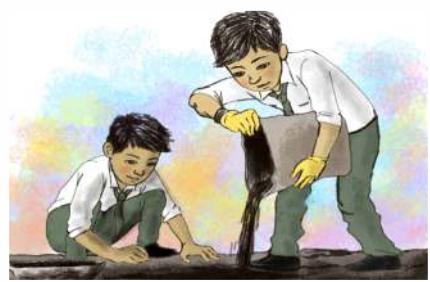
DO: They collected whatever material they could and through trial and error came up with the best possible way of leveling the potholes.

DO: They split into teams. One group did the digging and the other group started to make the tar.