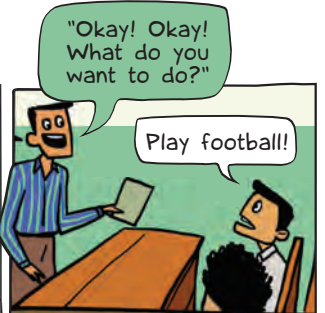
FEEL: Students realized that they could not play properly and there was no order.